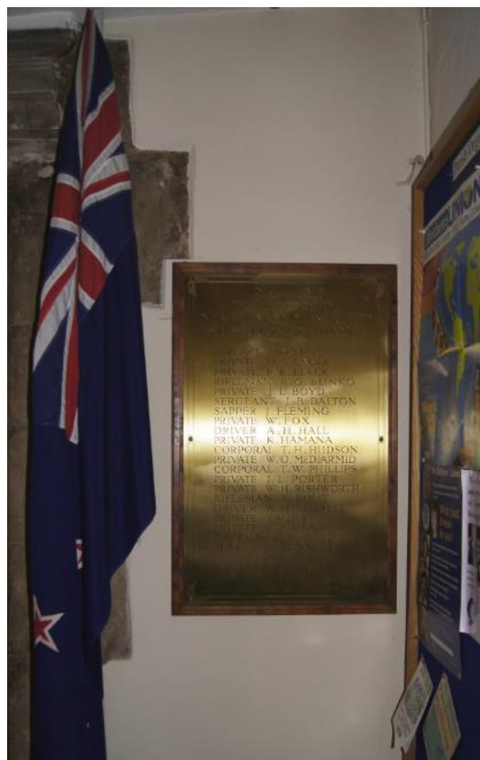
St. Mary's Walton-on-Thames Roll of Honour