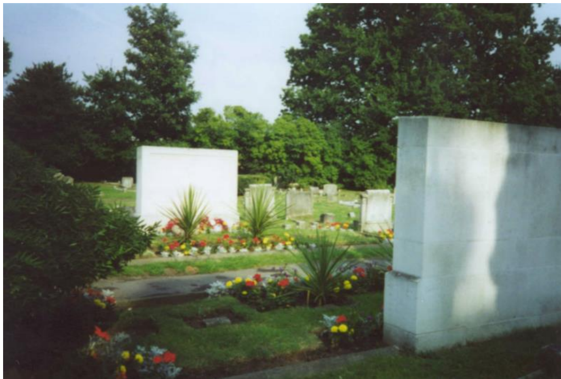
Screen Wall Memorials in Walton-On-Thames Cemetery & (below) St. Mary's Churchyard Walton-On-Thames

The commemoration of the casualties is on Screen Wall monuments rather than individual headstones as some graves contain more than one burial. Two plots containing eight grave spaces are directly in front of the two Screen Walls and the other plots are elsewhere in the graveyard.