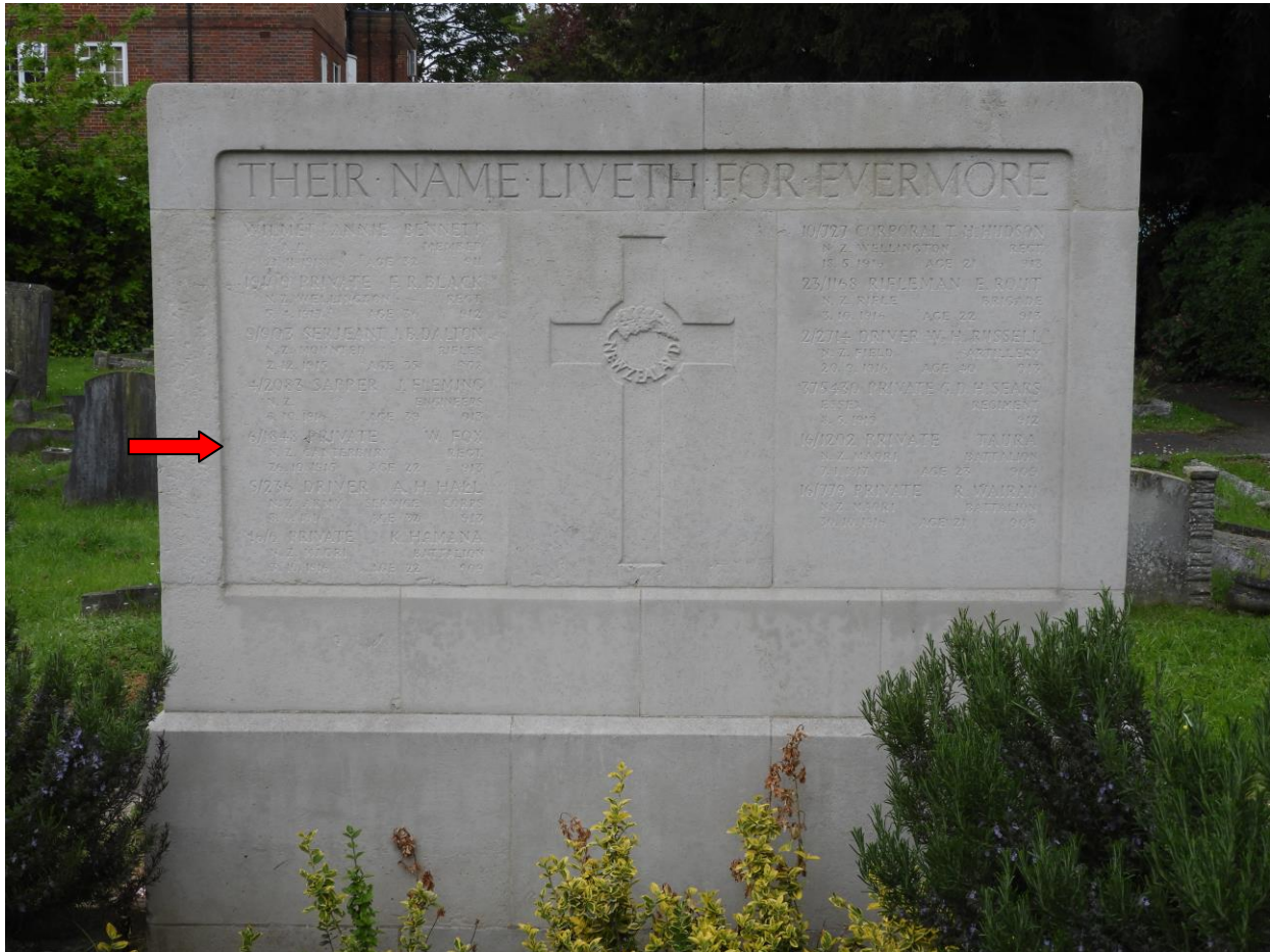
CWGC Screen Wall

Photo of Private W. Fox's name on the Commonwealth War Graves Commission Screen Wall Memorial in Walton-On-Thames Cemetery, Walton-On-Thames, Surrey, England.